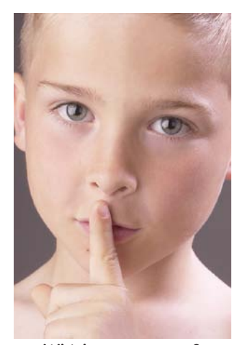
Which one are you?