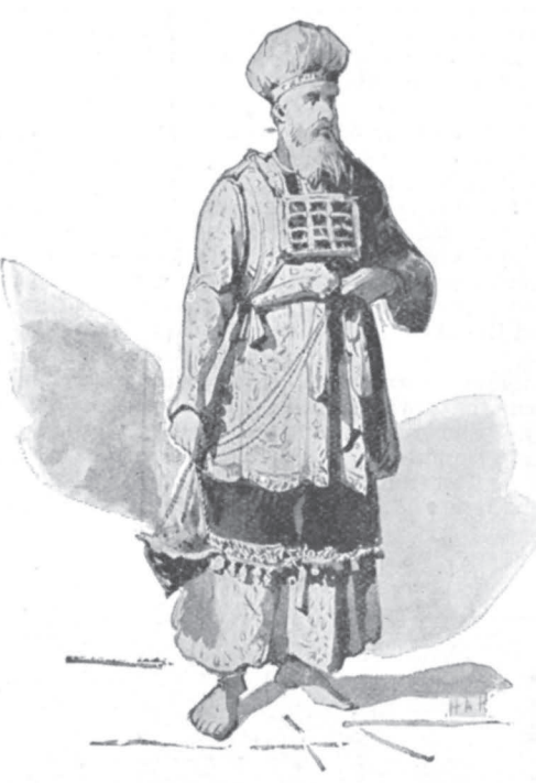
HIGH PRIEST IN ROBES AND BREASTPLATE. — Lev. viii,