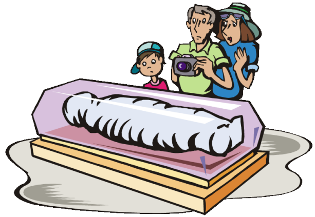
Moses chose between this (above) or this (below) as to how he'd be remembered in the future.

Think about it for a moment. If Moses had chosen to continue living in Pharaoh's palace, he might have become king over Egypt. Even if he had not become king, he still would have had untold wealth, fame and power in Egypt during his lifetime. But who would have remembered him after he died? His only claim to fame might have been as a mummy in a museum! How many Pharaoh's do you know the name of? If Moses had become a Pharaoh, how many people would know his name today? Yet how many billions of people over thousands of years have known the name of Moses because he chose to obey YHVH and they have read about him in the Bible?