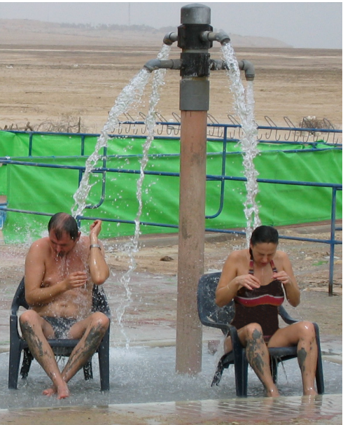
Sin makes us dirty and will kill us if we don't get cleansed from our sins.