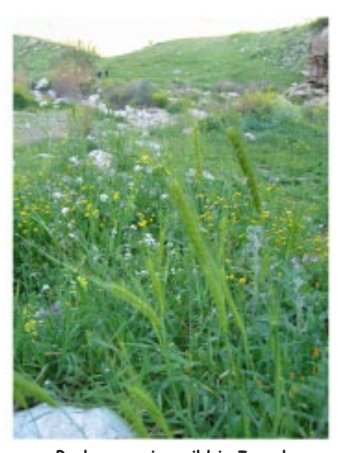
Barley growing wild in Israel

(h) Exodus 9:31 tells us which crop was green in the ear or head. Read that verse again. What grain crop was "in the ear" or abiv?