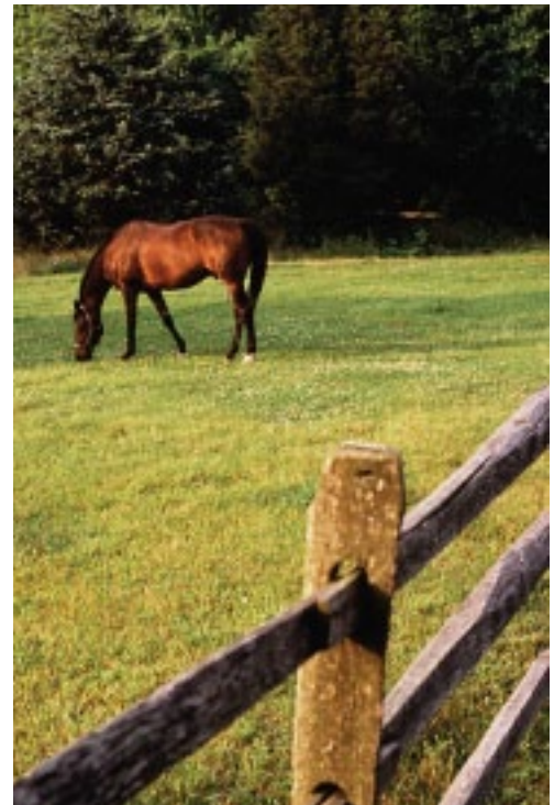
Torah is like a protective fence.