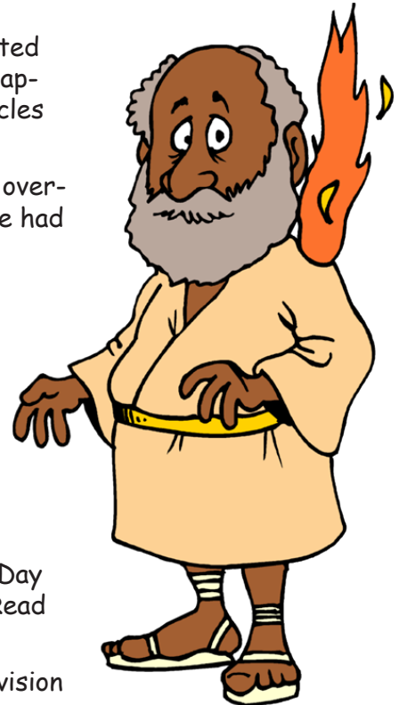
YHVH's anointed Presence on the day of Pentecost