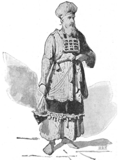
HIGH PRIEST IN ROBES AND BREASTPLATE. —Lev. viii. 8.