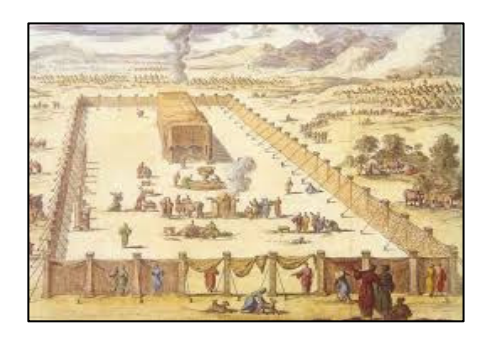
The Witness of Heaven on Earth