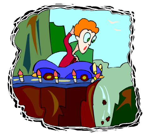
The Torah is like a guardrail on the road of life that keeps you from driving off the road and falling over the edge of a cliff.